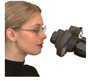
ISIS 'expanded-pupil' eyepiece accessory

ISIS expanded eyepiece modules are also available to improve the performance of other brand microscopes.