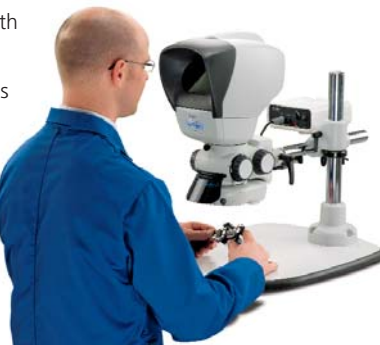
Lynx with boom mount

All systems present the operator with high contrast, high resolution three dimensional images. Patented optics allow for fatigue-free viewing with superb hand/eye co-ordination, leading to improvements in quality and productivity.