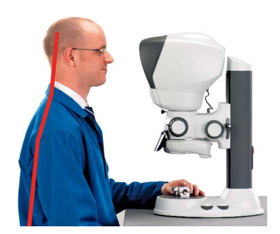
An example of Vision Engineering's patented Dynascope™ image projection technology.