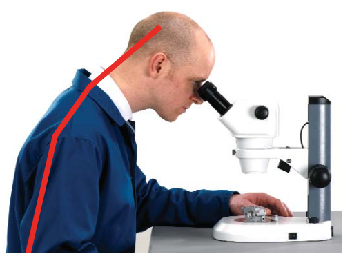
Conventional eyepiece microscope

Expanding the exit pupil results in the maximum axial and radial head freedom, vital for viewing tasks that take a long time or require repeated and precise checks. The combination of microscope resolution, image quality and patented exit pupil expansion result in unrivalled levels of ergonomics, sustaining operator accuracy, speed and efficiency.