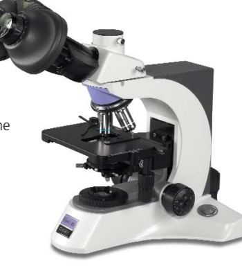
DX41 routine microscope, with optional ISIS eyepieces

The range includes both upright routine laboratory and inverted tissue culture microscopes, offering versatility and a wide range of accessories, including phase contrast, darkfield and fluorescence illumination.