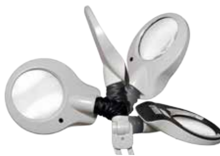
Friction-free joint between the lamp head and arm.