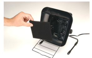
Replacing the filter is easy and economical.