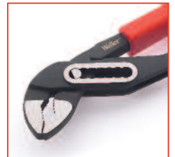
TGP250 Tongue & Groove Pliers