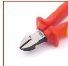
HLDCN160 High Leverage Diagonal Cutting Nipper