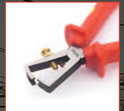
WS160 Wire Stripper