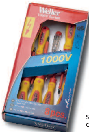
Screwdriver Set 8 pieces Code No. SD8SET