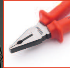
CP180 Combination Pliers