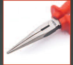
LNP200 Long Nose Pliers