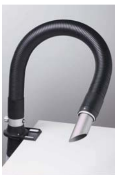
KIT 1 WF Sloped 60