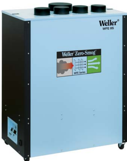
New mobile fume extraction unit WFE 8S purifies air up to eight workplaces!