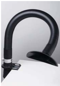
KIT 1 WF Funnel 60