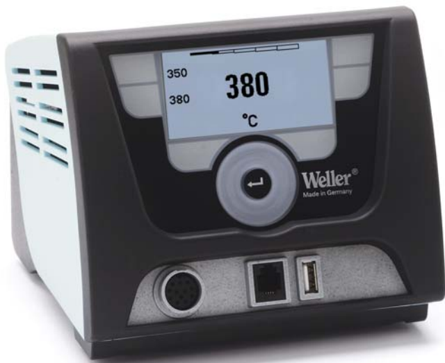
Soldering station WX 1