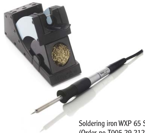
Soldering iron WXP 65 Set (Order-no. T005 29 212 99)