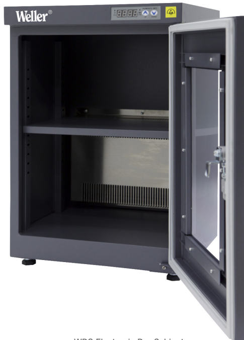
WDS Electronic Dry Cabinet